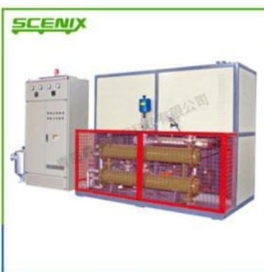
Electrical Heating Oil Heat Furnace