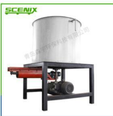
Glue mixing machine